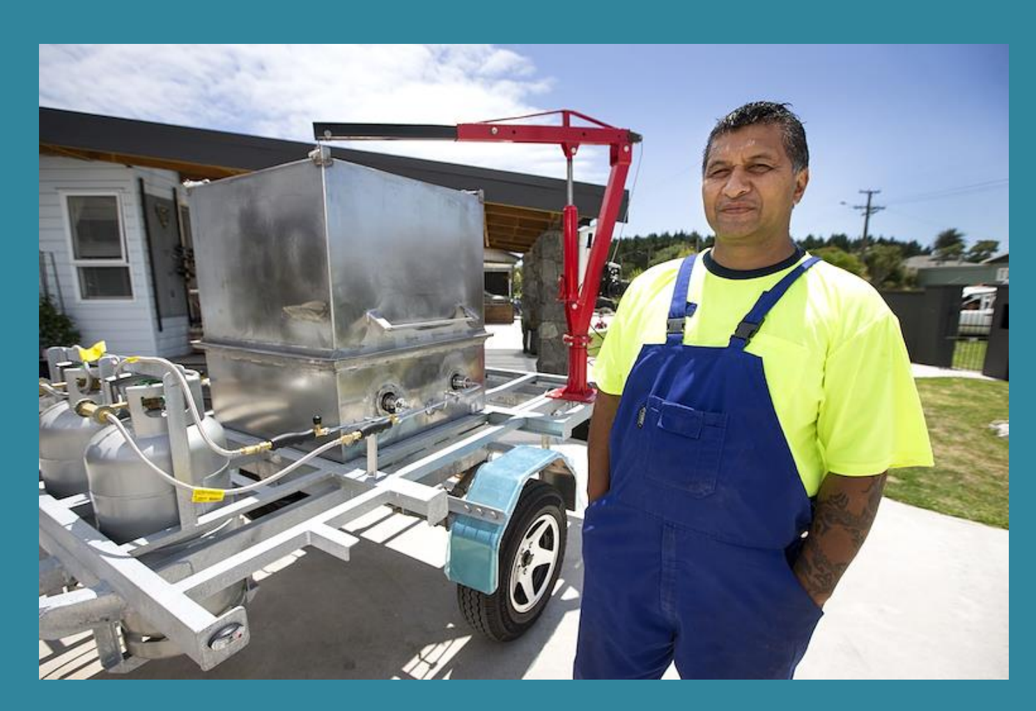
Te Kōhatu Hāngī Cookers

Specialist advice to support business growth in the following areas.